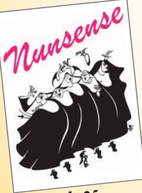
July 25 – September 8, 2013