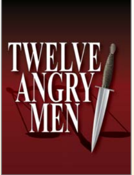
September 19 – November 3, 2013