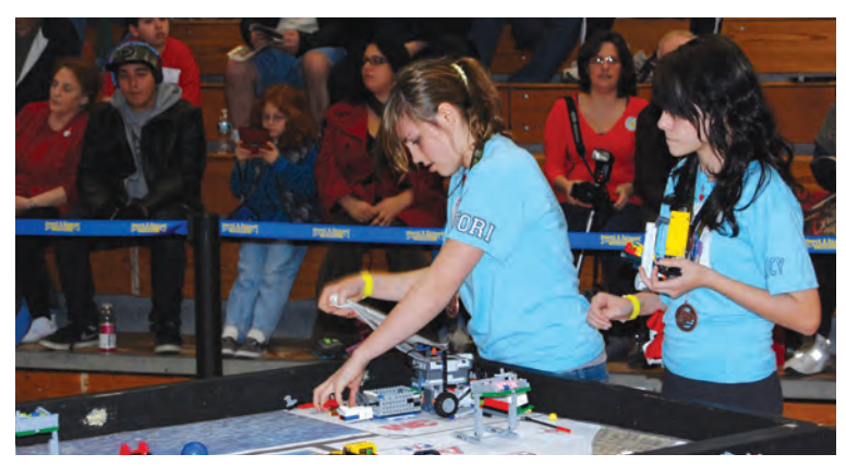
Members of Team #782 — "Sweeney Llamas" of Locust Valley prepare to program their robot during the FIRST LEGO League Championship Tournament.

FIRST LEGO League is an international program for 9- to 14-year-old children created in a partnership between FIRST and the LEGO Group in 1998, based on their common belief that fun and learning go hand-in-hand, and that an inspired mind can accomplish anything. Each September, FIRST LEGO League announces the annual Challenge to teams, engaging them in authentic scientific research and hands-on robotics design. Using LEGO MINDSTORMS technologies and LEGO play materials, children design, build, and program robots to complete missions based on real-world challenges. After eight intense weeks, the competition season culminates at high-energy, sports-like tournaments.