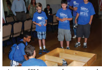
A group of FLL campers show parents and guests how their robot is able to navigate a maze during a presentation at School-Business Partnerships of Long Island's FIRST Robotics Summer Day Camp at Dowling College.