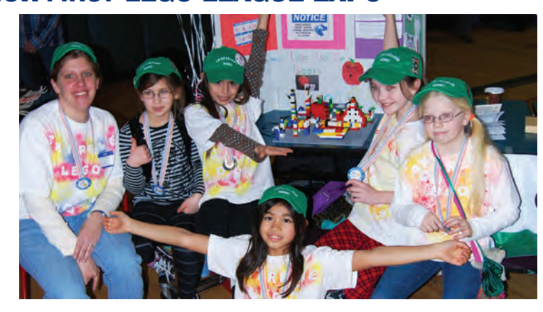
Members of the Girl Scouts of Suffolk County in Farmingville "Extreme LEGO GO GO Boots" — Team #481 show off their medals and their Show-Me poster at the Junior FIRST LEGO League Expo.

Focused on building an interest in science and engineering in children ages 6-9, Junior FIRST LEGO League is a hands-on program designed to capture young children's inherent curiosity and direct it toward discovering the possibilities of improving the world around them. Just like FLL, this program features a real-world challenge, to be solved by research, critical thinking and imagination. Guided by adult coaches and the Jr. FLL Core Values, students work with LEGO elements and moving parts to build ideas and concepts and present them for review. Each yearly Challenge has two parts: the LEGO Model and the Show-Me Poster. Working in teams of two to six children and guided by at least one adult coach, teams worked to complete the Challenge.